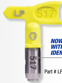
Part # LPXXX

Delivers the finest finish— now available in 106, 206, and 408 sizes for even more control