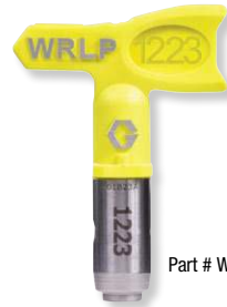
Part # WRLPXXX

Spray every surface at low pressure with 30 available sizes to maximize profit on every job