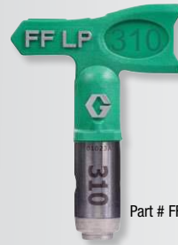
Part # FFLPXXX