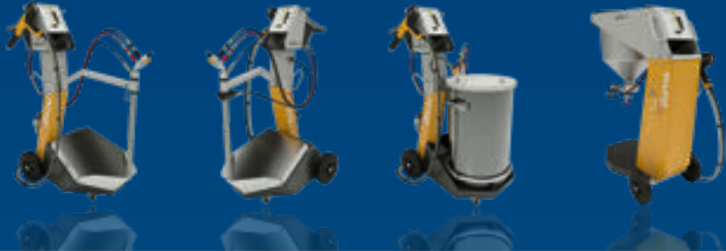
OptiFlex® Pro B OptiFlex® Pro Q OptiFlex® Pro F OptiFlex® Pro S