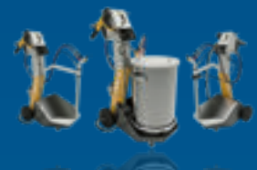
OptiSelect® Pro Type GM04 OptiStar® Type CG21 OptiFlex® Pro Manual coating equipment