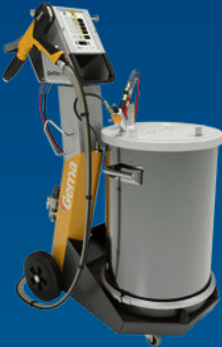
OptiFlex® Pro F