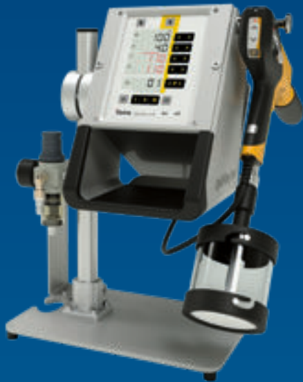
OptiFlex® Pro C