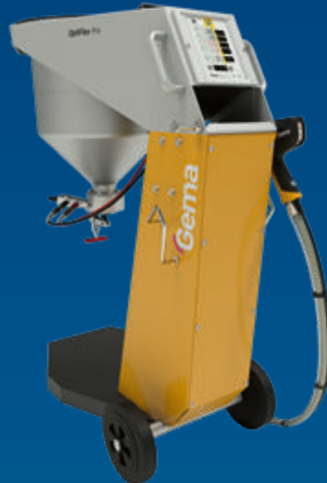
OptiFlex® Pro S