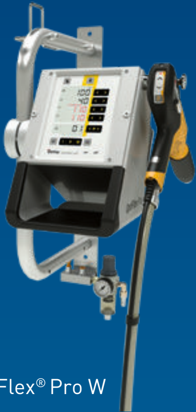
OptiFlex® Pro W