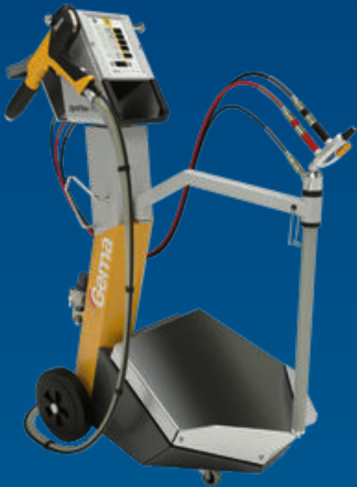
OptiFlex® Pro B