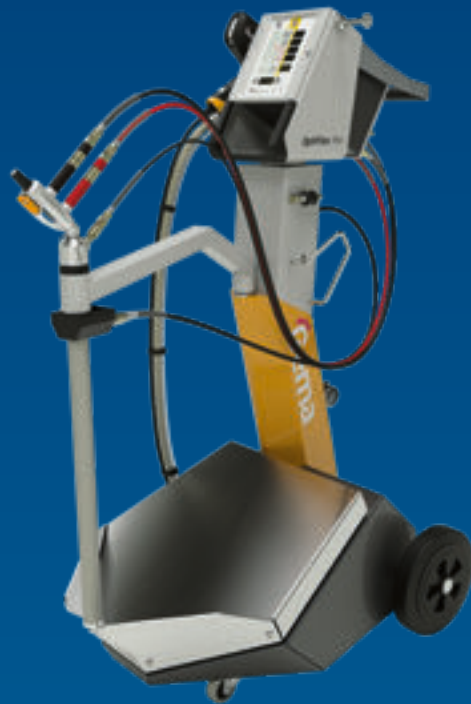
OptiFlex® Pro Q