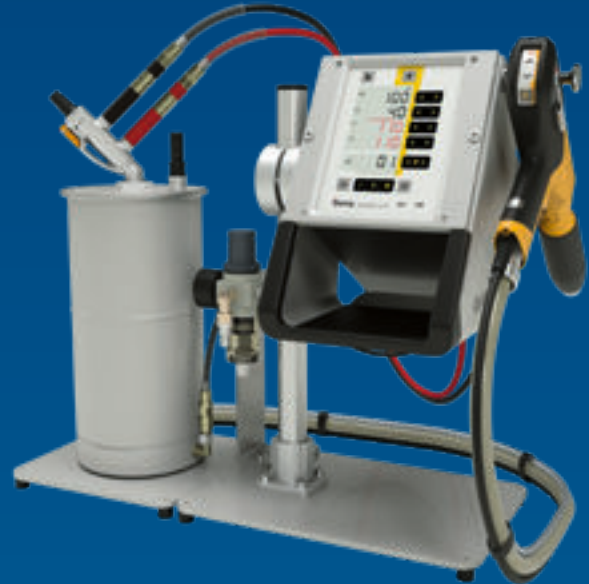
OptiFlex® Pro L