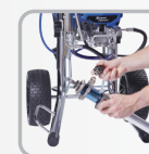
Remove Hose & Suction Tube