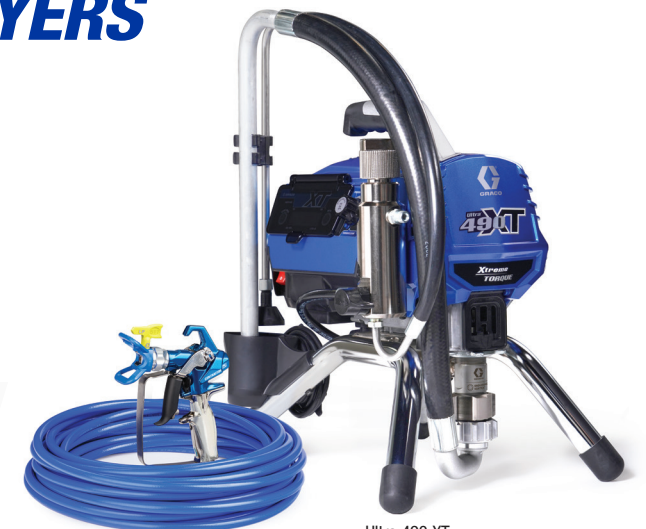
Ultra 490 XT Stand 19D531

Midsized electric airless sprayers make it easier to get more work done in a day with increased flow and production rates.