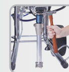
Loosen the Clamping Nut