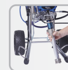
Open Door & Remove Pump